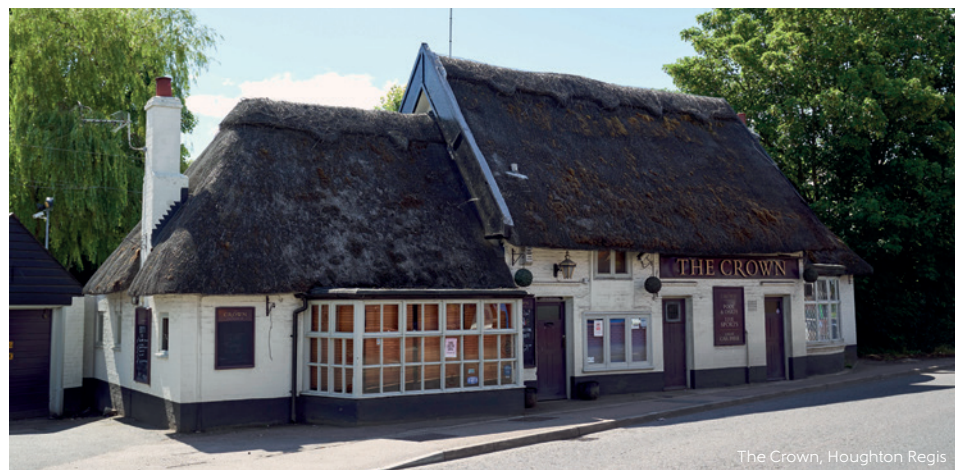
The Crown, Houghton Regis