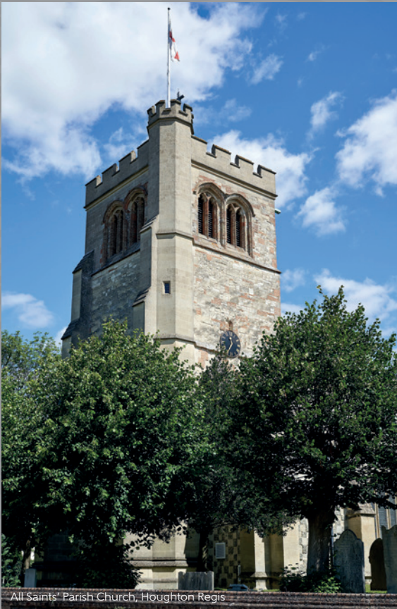
All Saints' Parish Church, Houghton Regis

Bellway at Linmere is a collection of 1, 2, 3 and 4-bedroom homes forming part of a desirable new residential community in the well-connected town of Houghton Regis. Residents will benefit from excellent transport links within the close surrounding area, frequent local rail services and a prime location within commuting distance of London. Luton, Dunstable and Milton Keynes are all less than 30 minutes away by car. The M1 is accessible in around 6 minutes, providing direct access into North West London. For international travel, Luton Airport is around 20 minutes away by car.