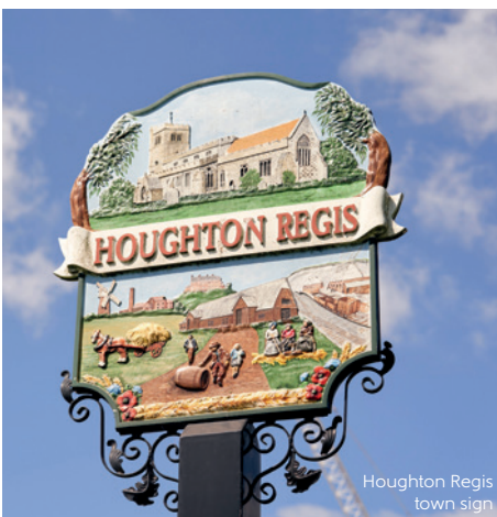
Houghton Regis town sign

Built across a variety of styles to the exacting Bellway standard, these homes present a range of design features including open-plan living spaces, contemporary fitted kitchens and bathrooms in addition to either garages or allocated parking to each property.