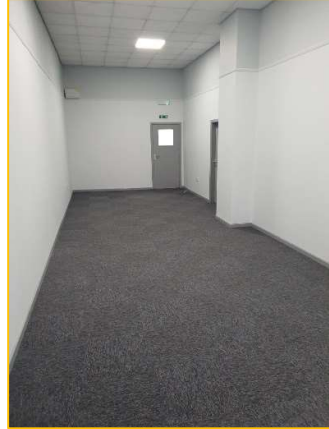
Samples of Refurbished Condition