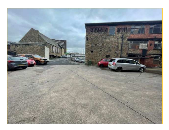
Access and Car Parking

The occupiers of the first floor of the warehouse building do so under flexible tenancies which have a potential to be extended by negotiation.