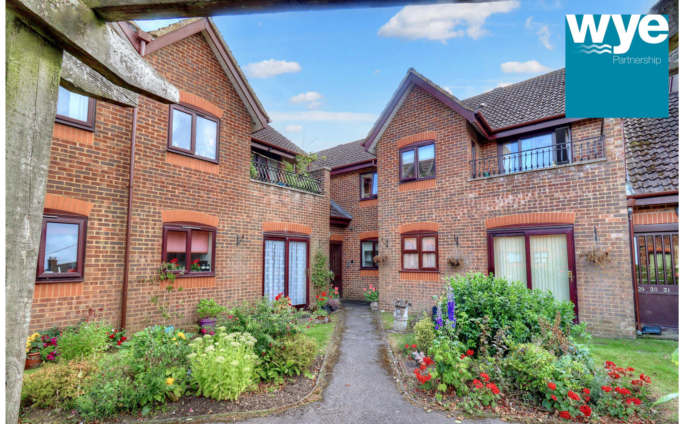
28 Old School Close, Stokenchurch, Buckinghamshire, HP14 3RB - £160,000