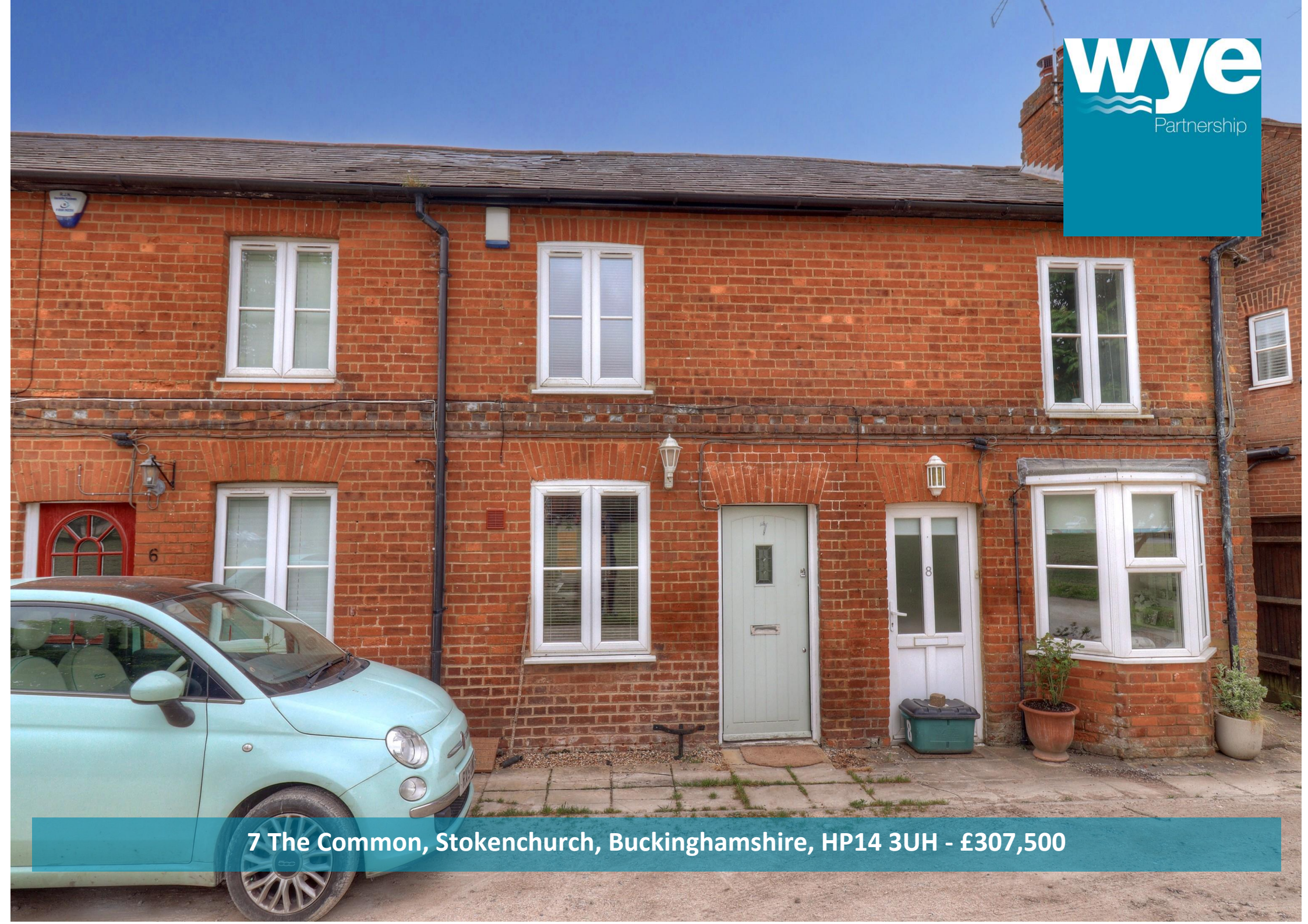
7 The Common, Stokenchurch, Buckinghamshire, HP14 3UH - £307,500