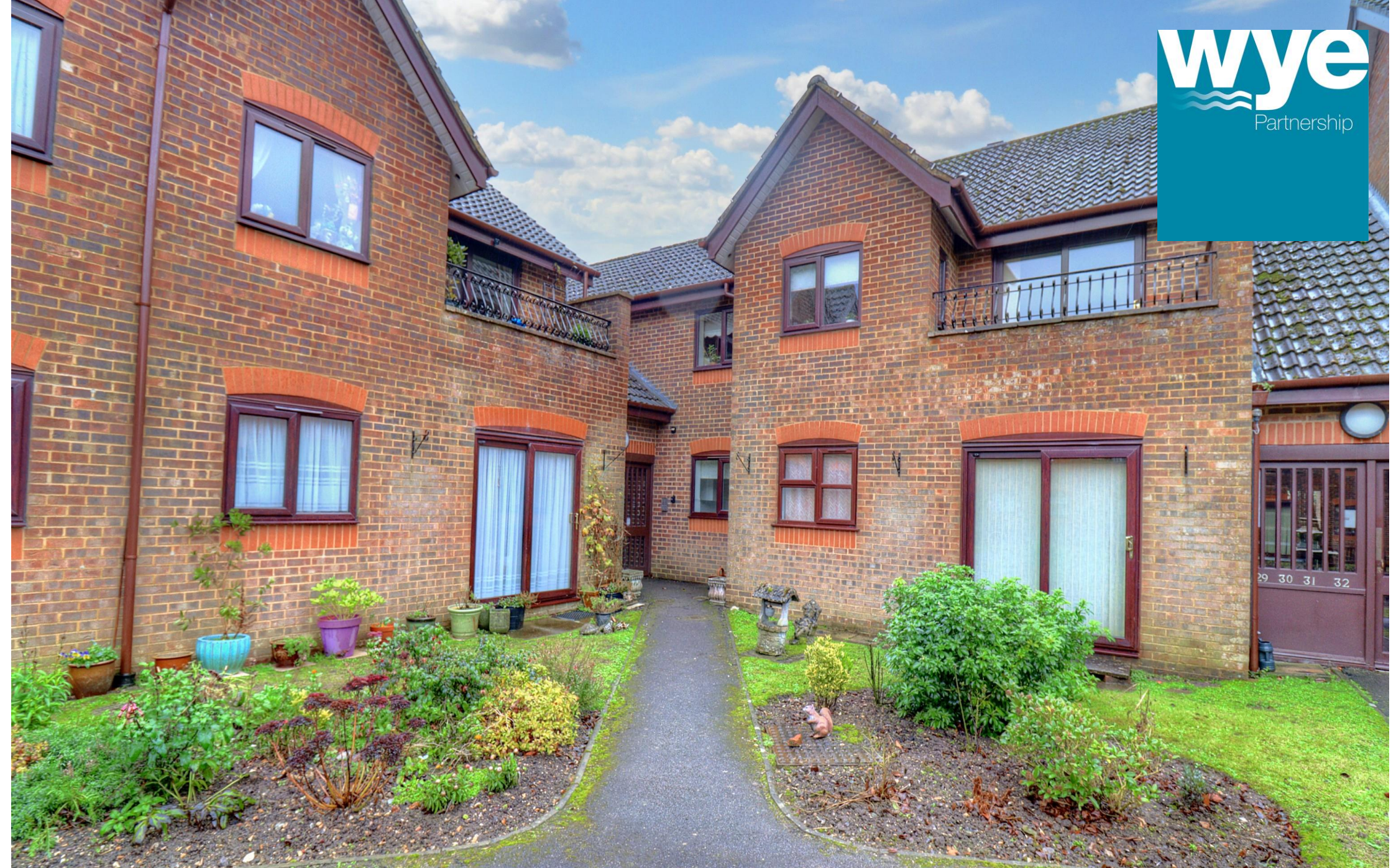
27 Old School Close, Stokenchurch, Buckinghamshire, HP14 3RB - £175,000