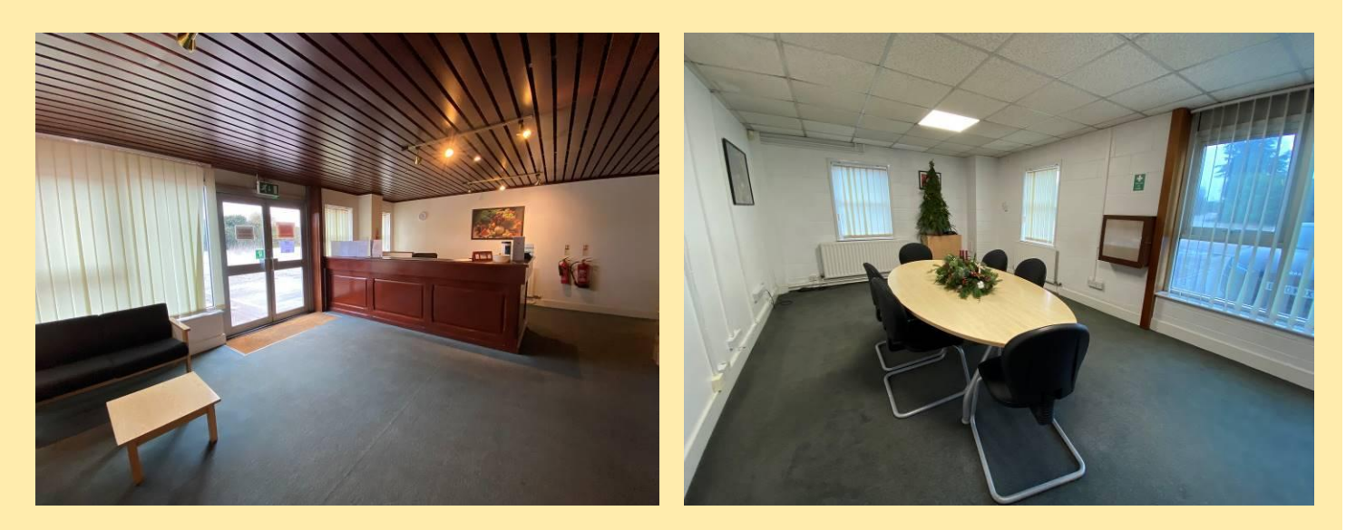
FIRST FLOOR OFFICES, comprising Main Open Plan offices, Front Offices, Open Plan Rear Offices and further WC facilities

GROUND FLOOR OFFICES, comprising Reception, Board Room, various offices, WC's