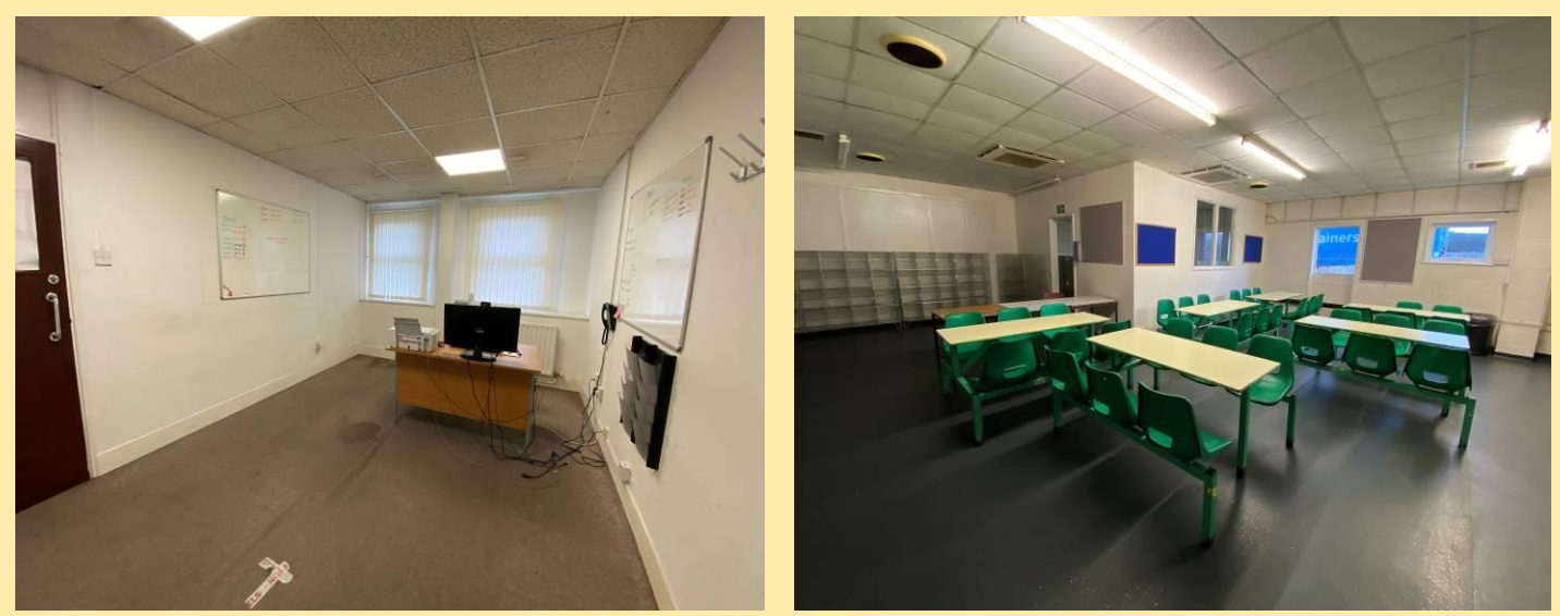
AMENITIES AREA comprising Canteen, Lockers, Changing Rooms