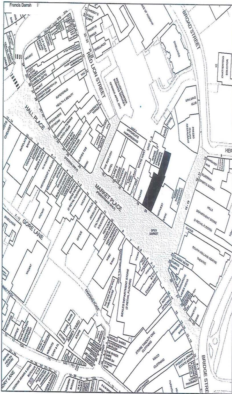
Good Digital Plans are for identification purposes only and not to be scaled as a working drawing and are based upon the OS Map with the permission of The Controller of His Majesty's Stationary Office © Crown Copyright 39954X