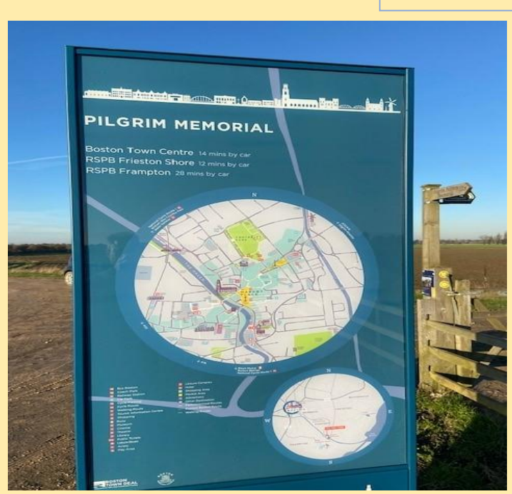
SIGN FOR PILGRIM MEMORIAL