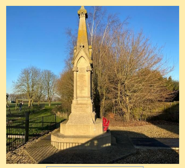
FISHTOFT WAR MEMORIAL