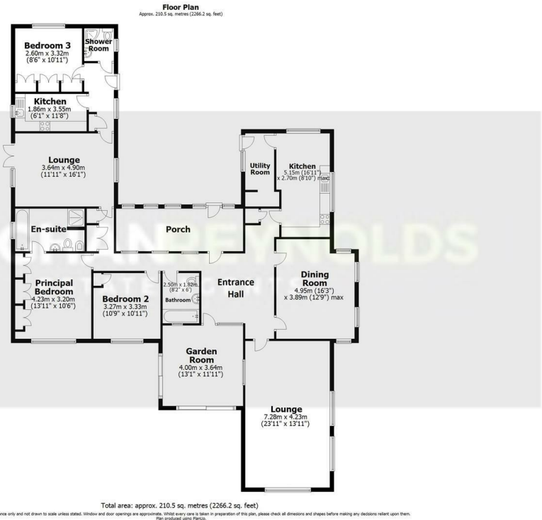
This plan is for layout guidance only and not drawn to scale unless stated. Window and door openings are approximate, whilst every care is taken in preparation of this plan, please check all dimensions and shapes before making any decisions reliant upon them. Plans produced using Planity.

VaughanReynolds, for themselves and for the vendors of the property whose agents they are, give notice that these particulars do not constitute any part of a contract or offer, and are produced in good faith and set out as a general guide only. The vendor does not make or give, and neither VaughanReynolds nor any person in their employment, has an authority to make or give any representation or warranty whatsoever in relation to this property.