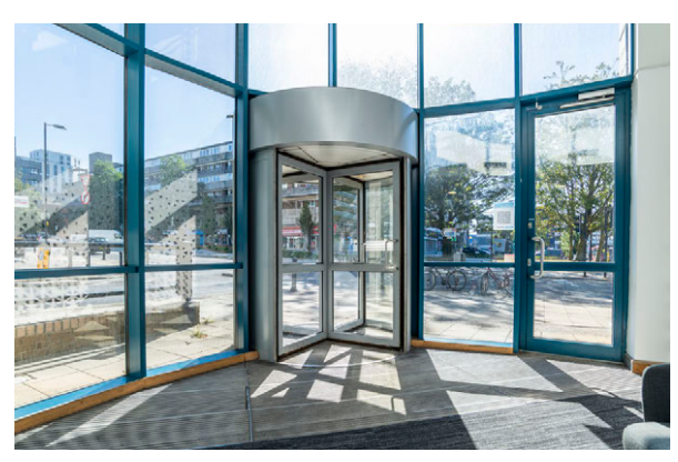
View from reception towards Southampton Train Station.