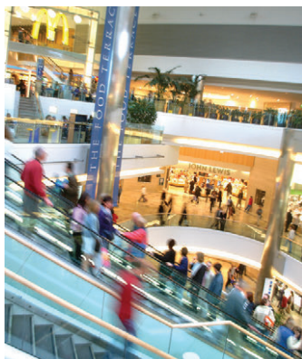
Top: Showcase Cinema. Above: Ocean Village Marina and Harbour Hotel and Spa. WestQuay Shopping Centre.