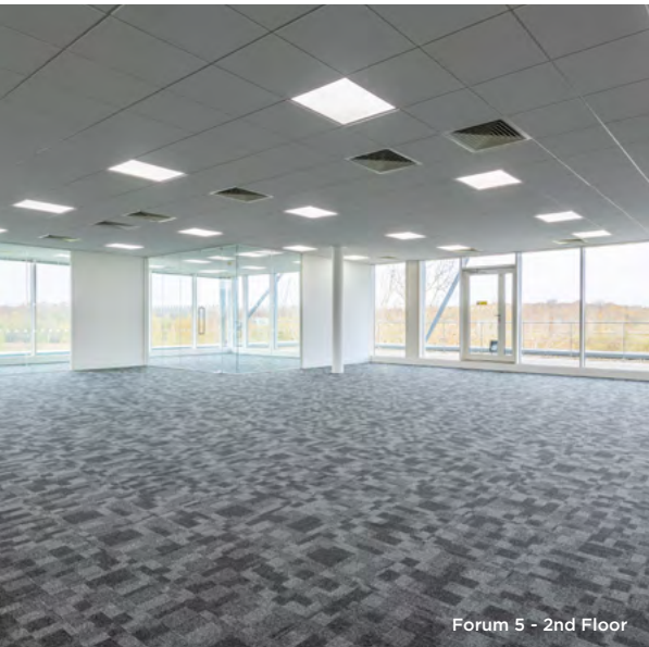
Forum 5 - 2nd Floor