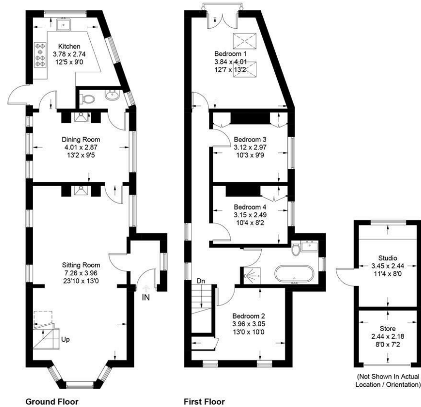
Illustration for identification purposes only, measurements are approximate, not to scale. floorplansUsketch.com © (ID785886)