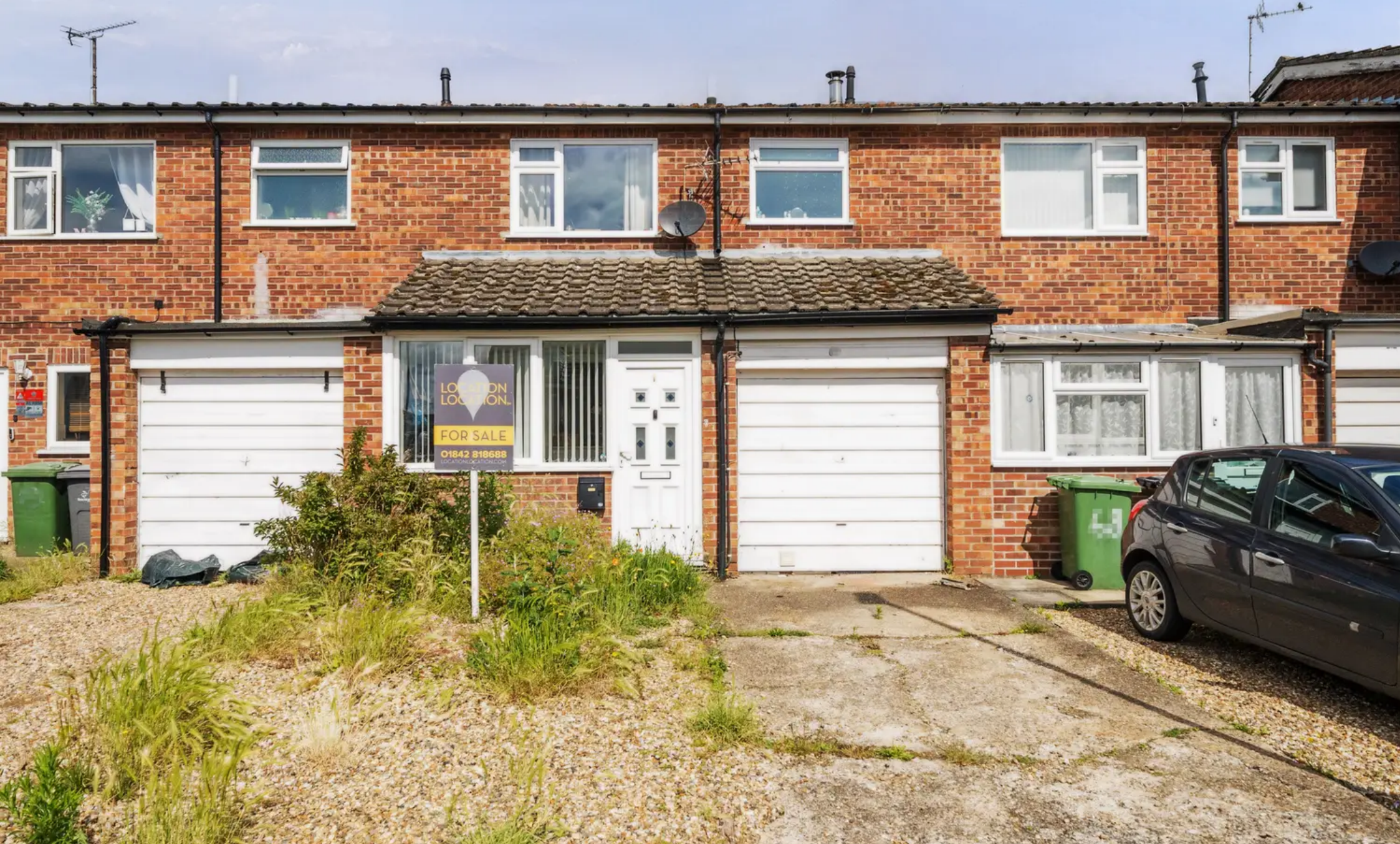
Glebe Close, Thetford