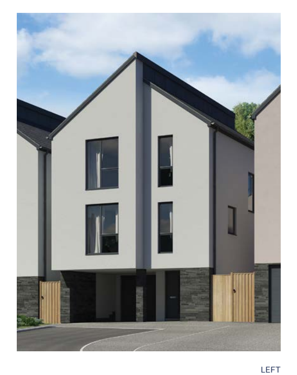
Wembury ABOVE Kingsbridge

Applegate comes from the Middle English 'applegarth', meaning an apple orchard. During the 19th century, cider was one of the chief exports of Kingsbridge and many farms in the area had their own orchard.