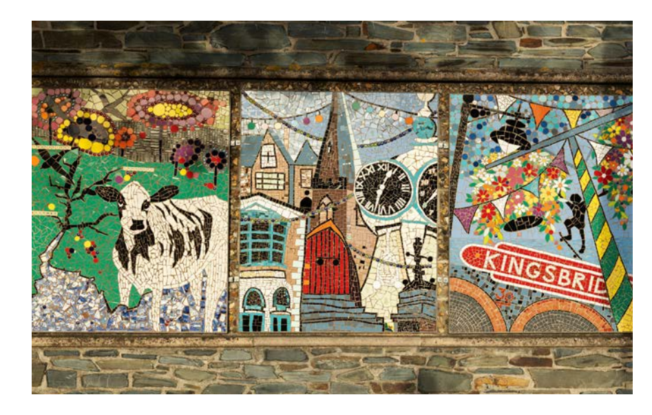
Entrance to Salcombe Harbour & Kingsbridge Community Mosaic

South Devon offers an abundance of rural views, rugged coastline and lively towns — a haven for walking and watersports alike.