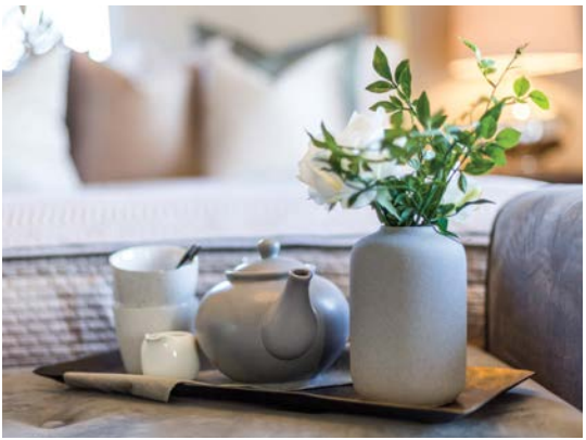
ABOVE & RIGHT Typical Devonshire Homes interiors — not site specific