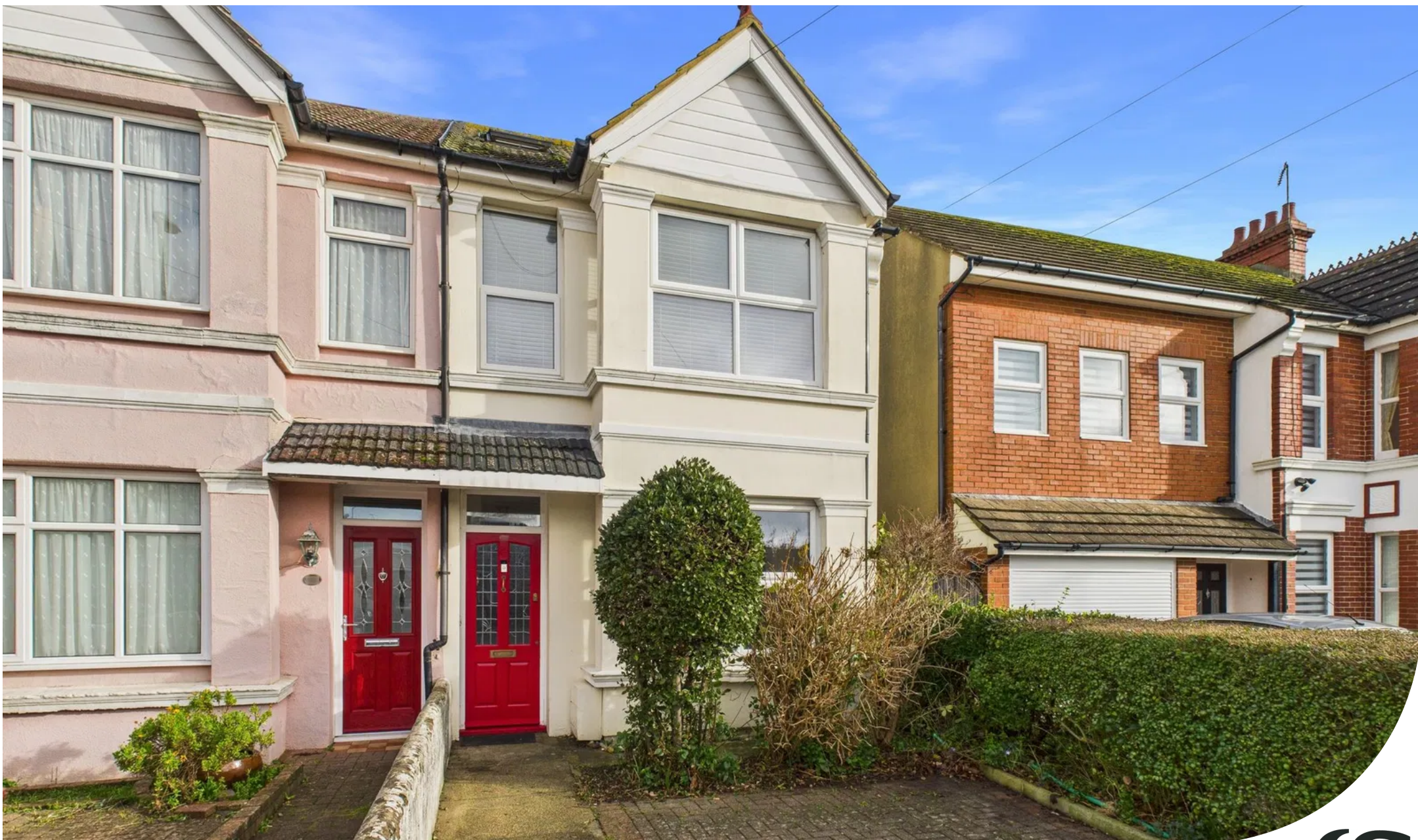
Cross Road, Southwick £550,000