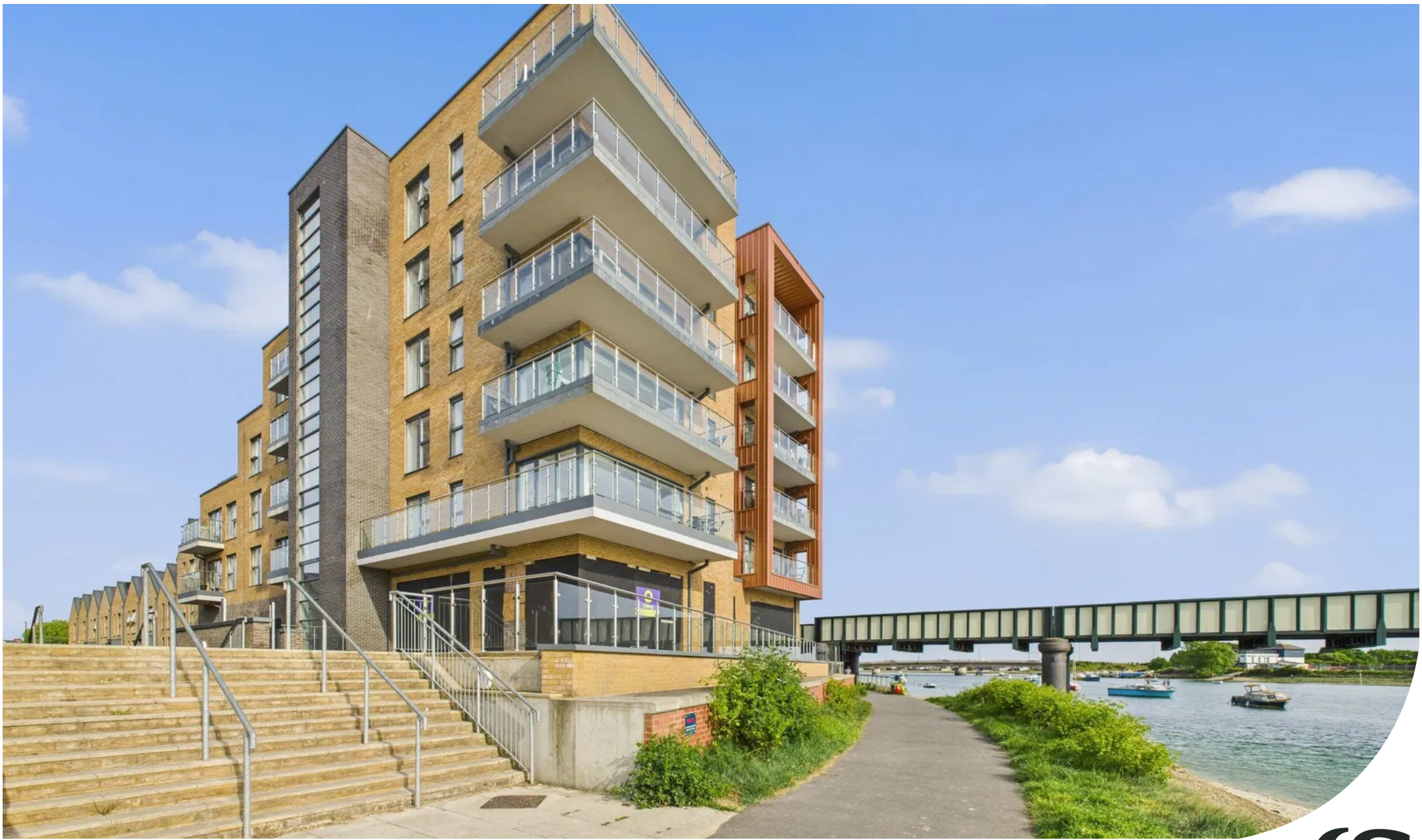
Salt Marsh Road, Shoreham by Sea £400,000