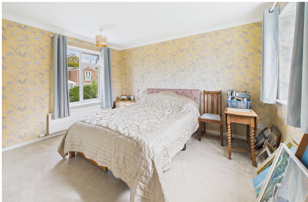
Property details: Lesser Foxholes | Shoreham by Sea | BN43 5NT