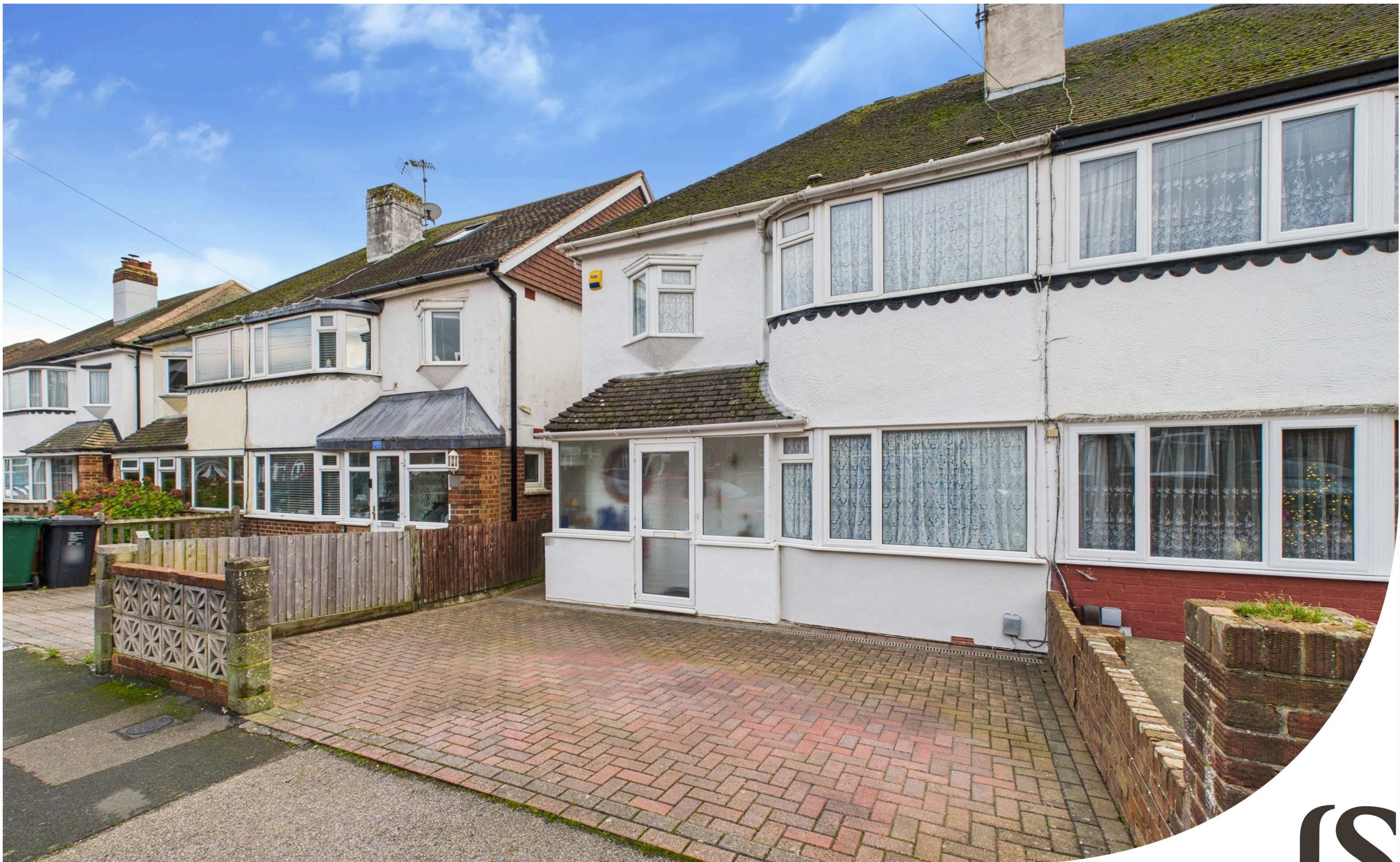
Mile Oak Gardens | Portslade | BN41 2PH Offers Over £425,000