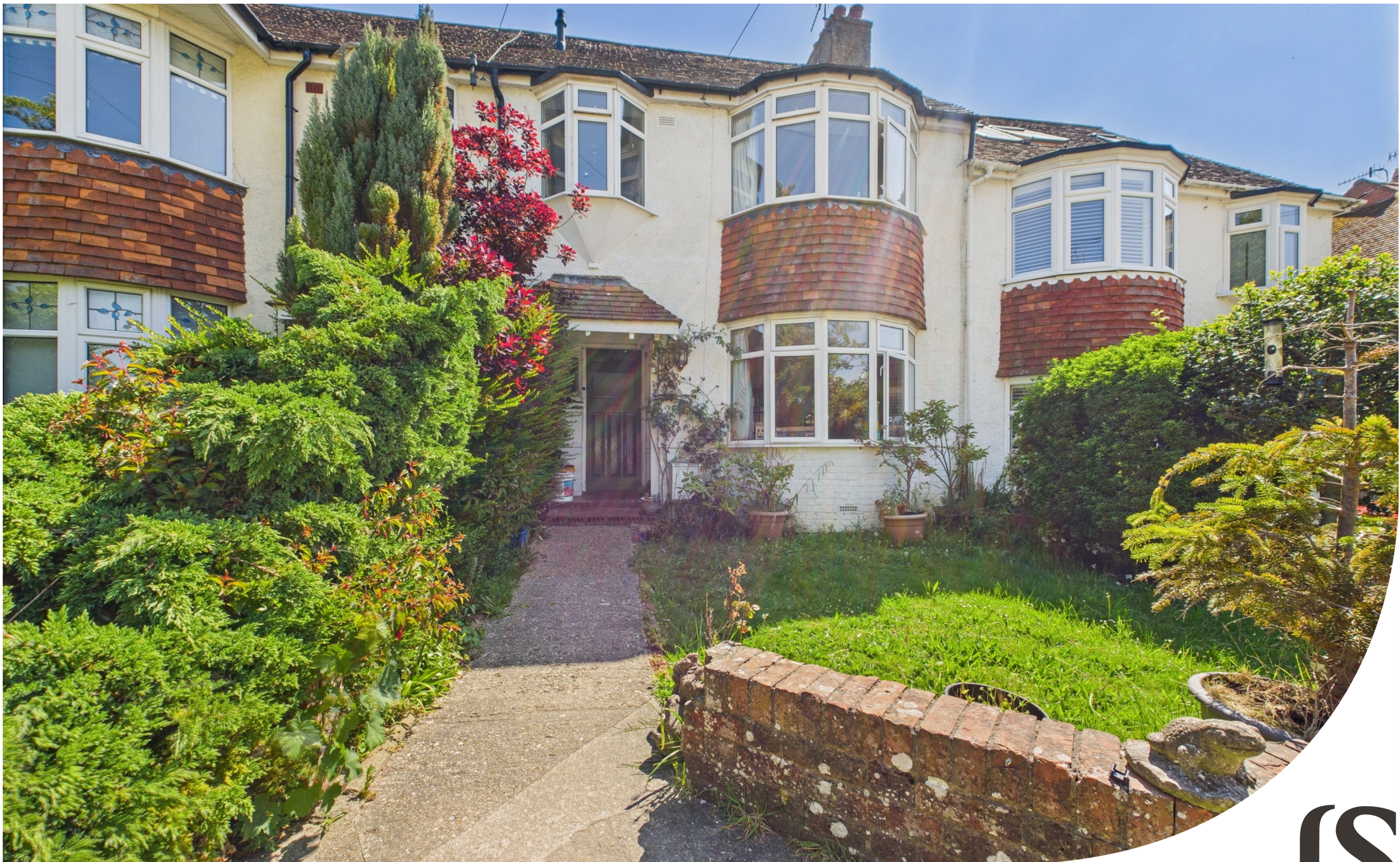
Parkside | Shoreham by Sea | BN43 6HA Guide Price £650,000