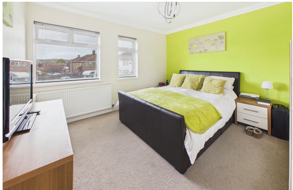
Property details: Orchard Close | Southwick | BN42 4NJ