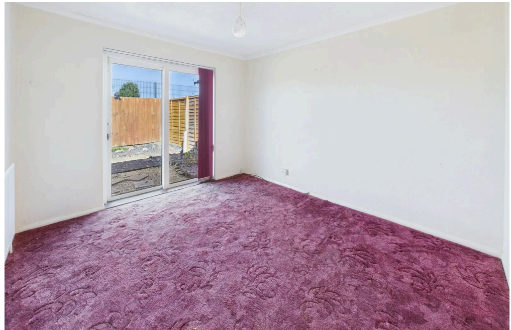
Property details: Ashcroft Close | Shoreham by Sea | BN43 6YR