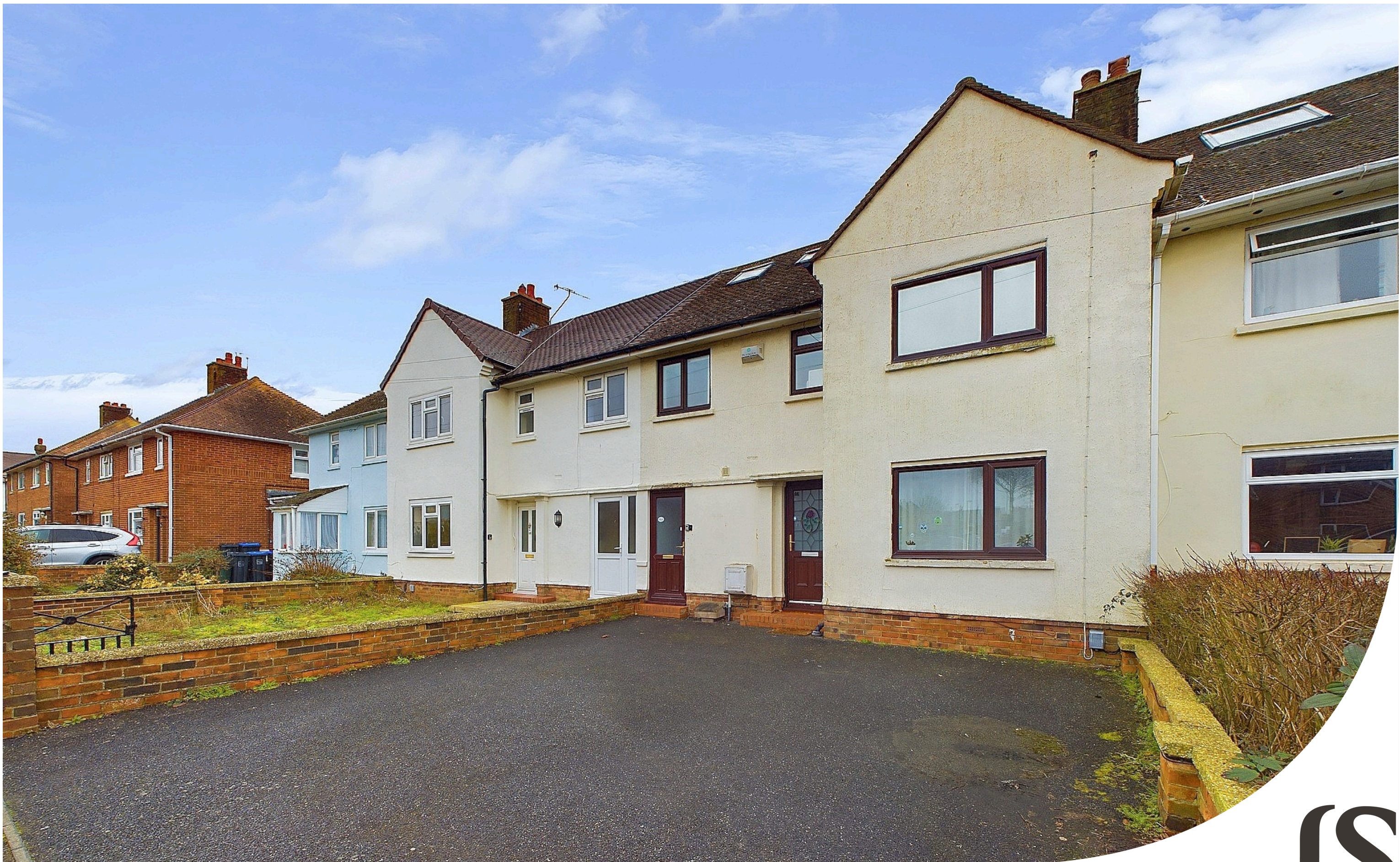
Williams Road | Shoreham by Sea | BN43 6BQ £350,000