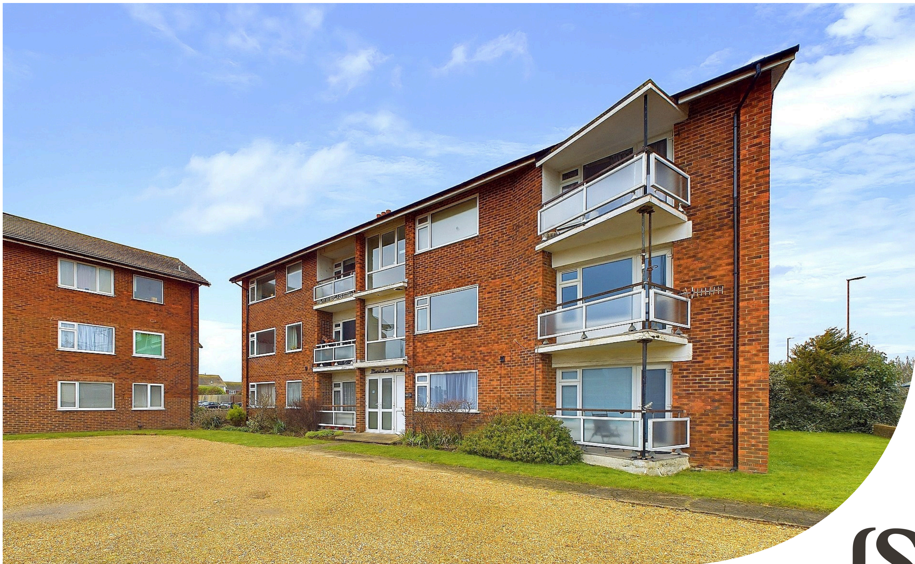
Marine Court, Beach Green | Shoreham by Sea | BN43 5LQ Offers Over £230,000