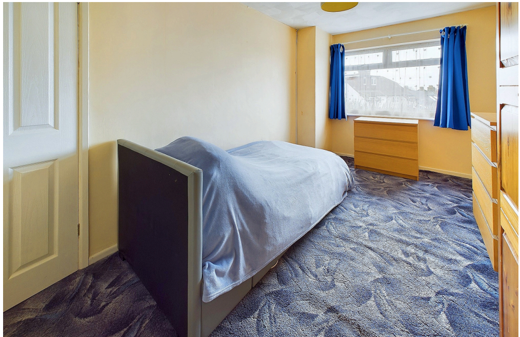
Property details: Old Shoreham Road | Southwick | BN42 4TR