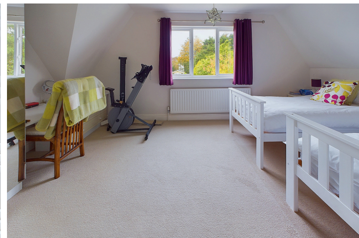
Property details: Hamfield Avenue | Shoreham by Sea | BN43 5TY