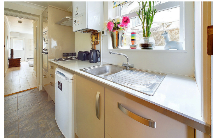
Property details: Buckingham Road | Shoreham by Sea | BN43 5UD