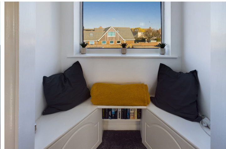
Property details: Old Fort Road | Shoreham by Sea | BN43 5HL