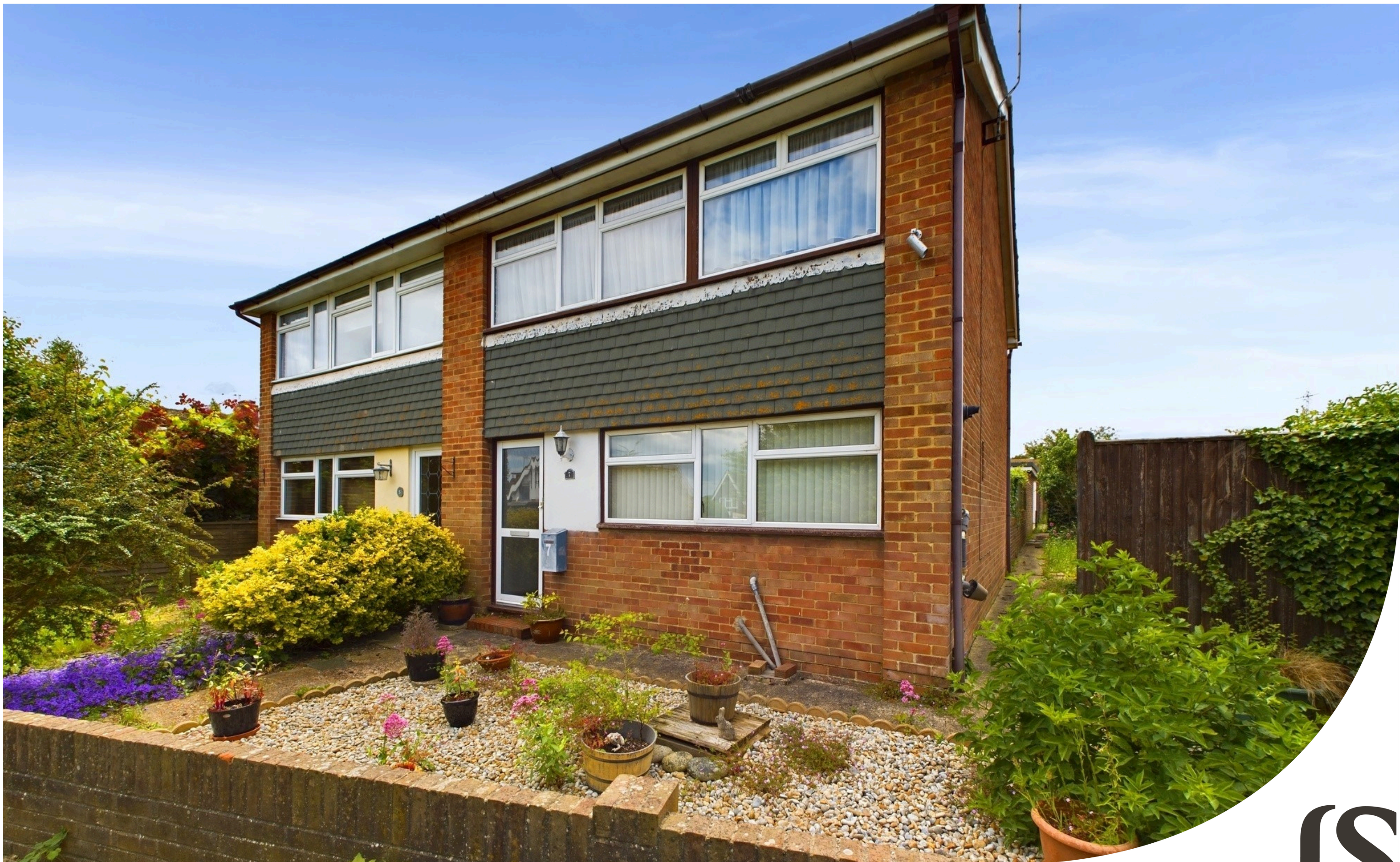
Rowan Close | Portslade | BN41 2PT Guide Price £375,000 - £400,000