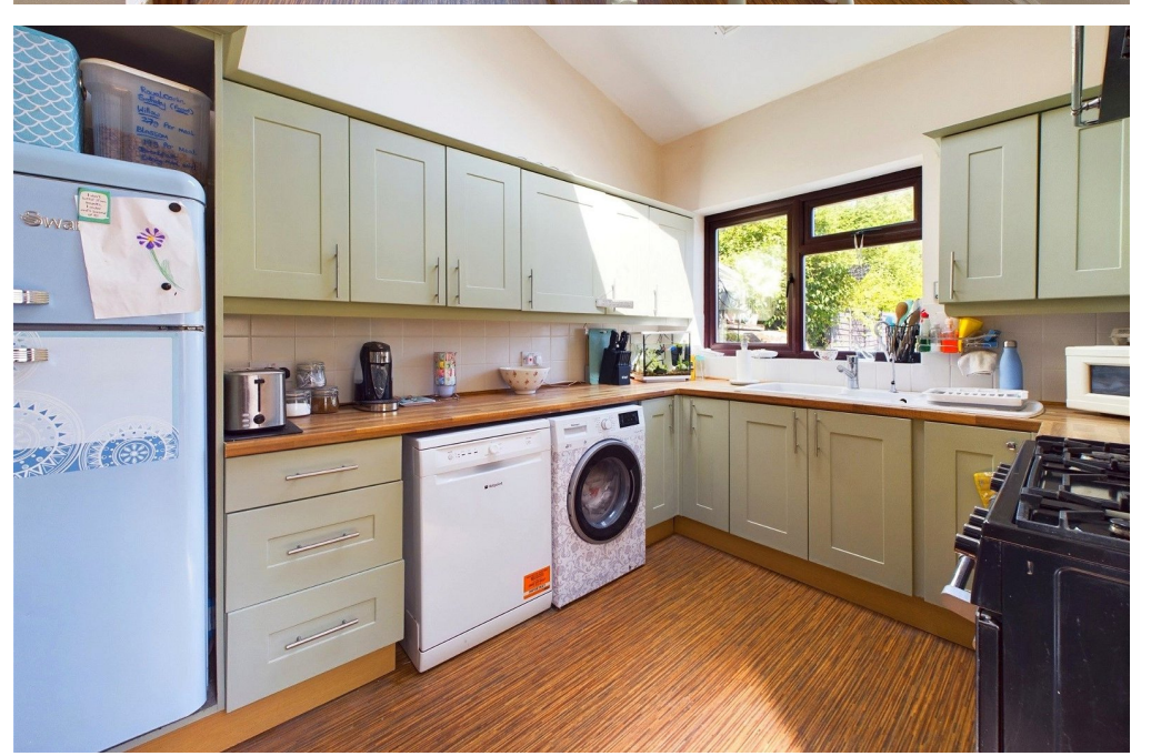
Property details: Brighton Road | Shoreham by Sea | BN43 6RG