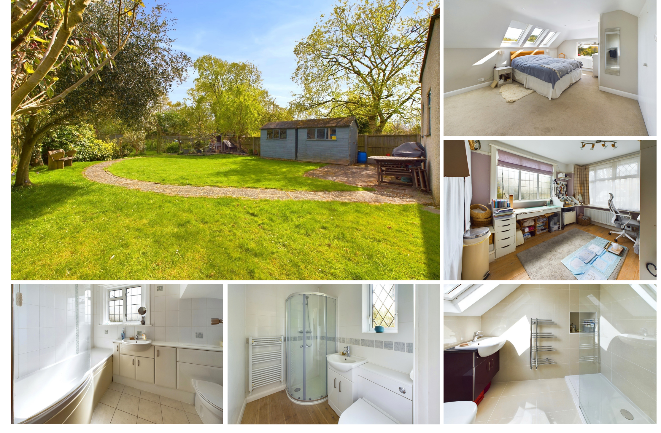
Property details: Buckingham Road | Shoreham by Sea | BN43 5UD