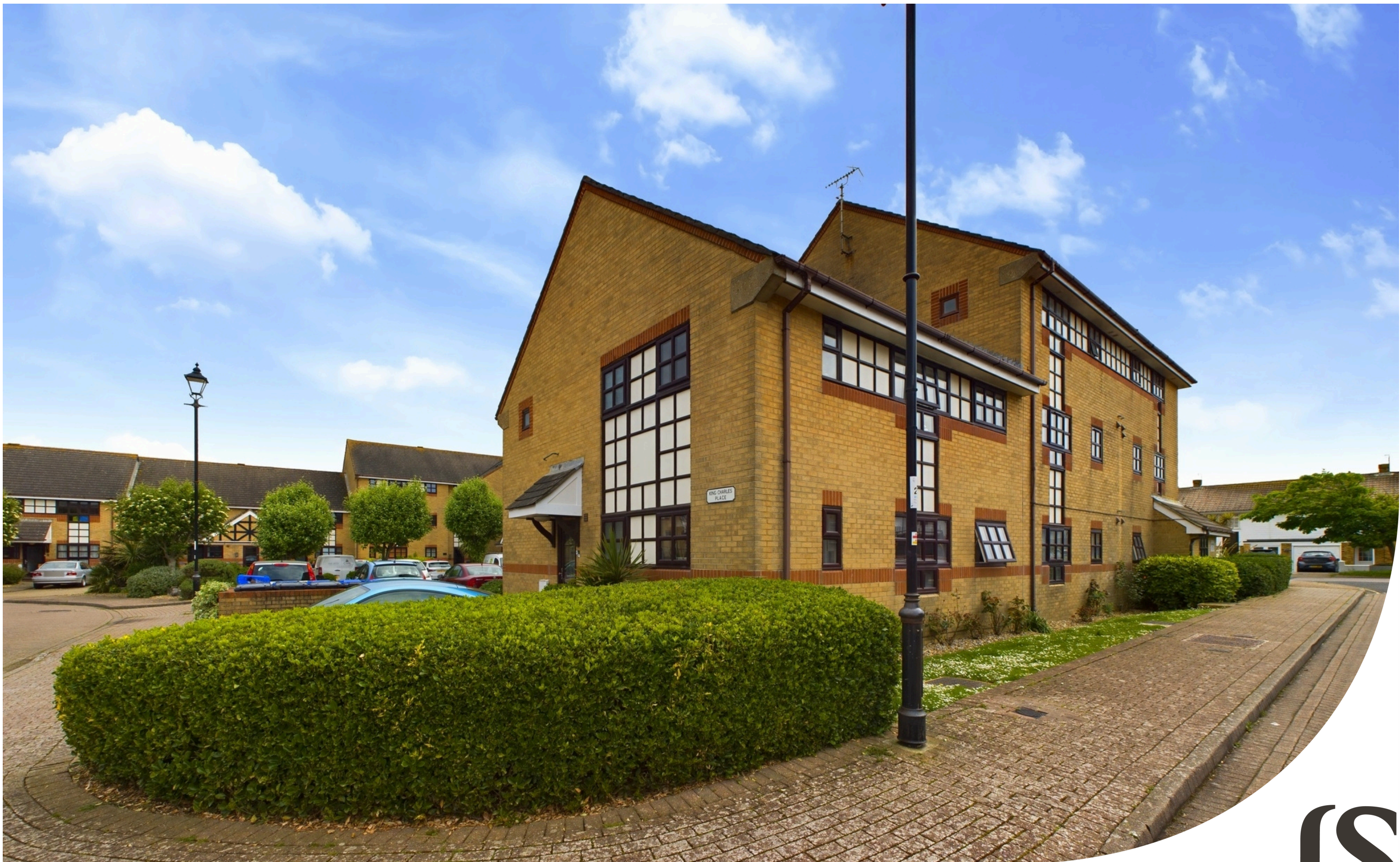
King Charles Place | Shoreham by Sea | BN43 5JH Guide Price £300,000