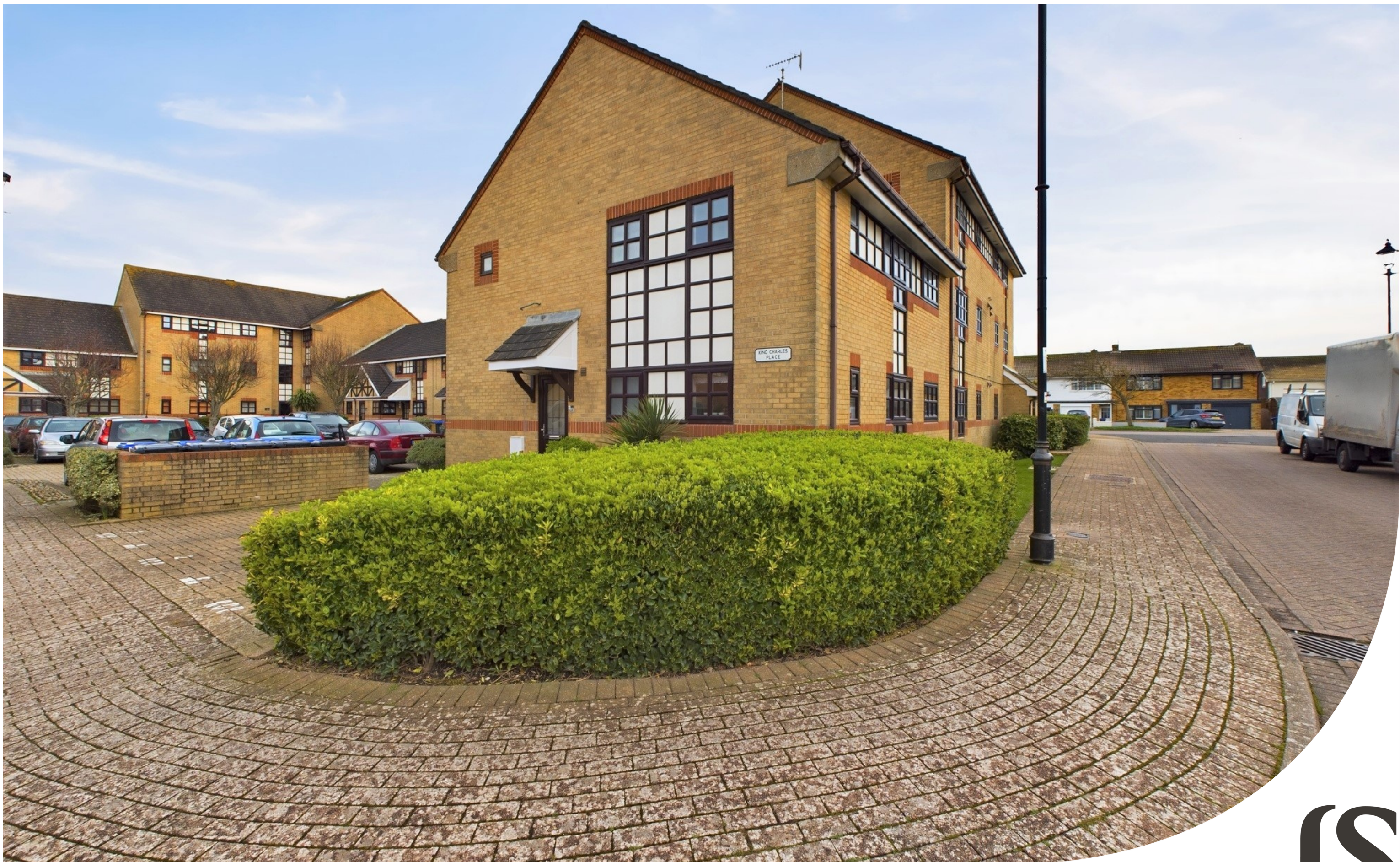
King Charles Place | Shoreham by Sea | BN43 5JH Guide Price £300,000