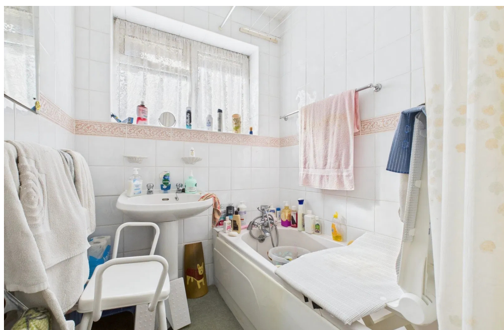
Property details: 231A Brighton Road, Lancing