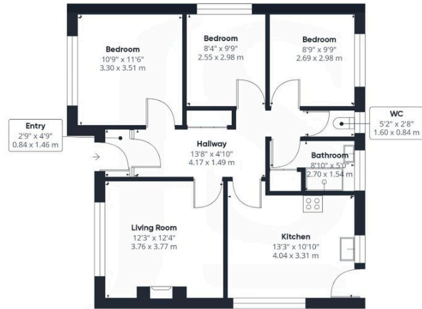
Floor 0 Building 1