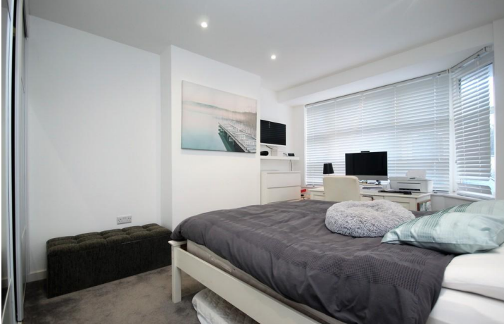
Property details: 3 Vincent Close | Lancing | West Sussex | BN15 9LL