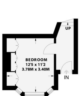
Raised Ground Floor 180 sq ft / 16.7 sq m