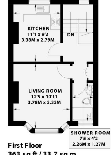
363 sq ft / 33.7 sq m