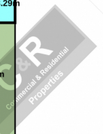
C & R PROPERTIES