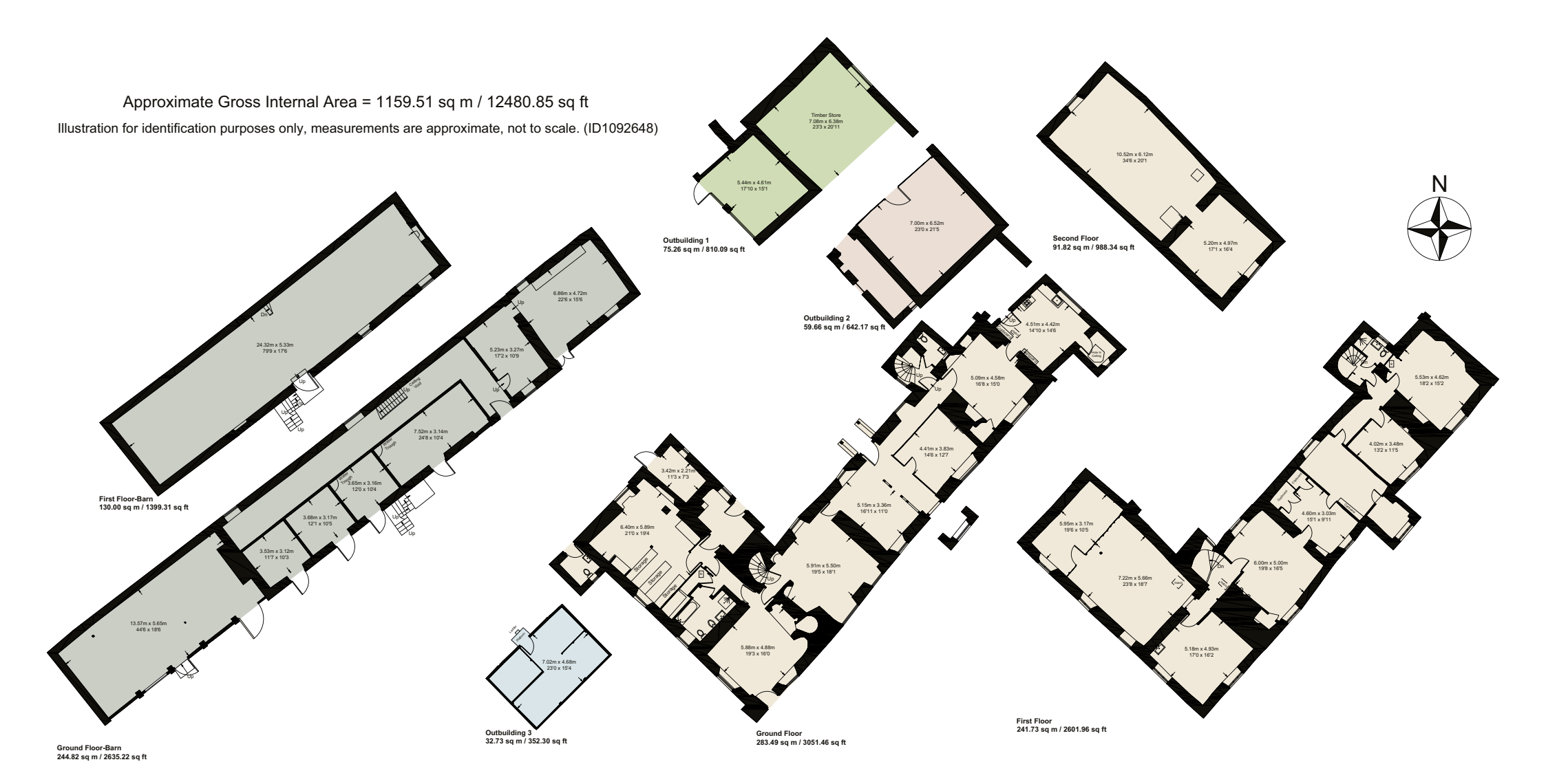
Disclaimer 1. These particulars, including any plan, are a general guide only and do not form any part of any offer or contract. All descriptions, including photographs, dimensions and other details are given in good faith but do not amount to a representation or warranty. They should not be relied upon as statements of fact and anyone interested must satisfy themselves as to their correctness by inspection or otherwise. 2. Neither Butler Sherborn LLP, nor the seller, accepts responsibility for any error that these particulars may contain however caused. Neither the partners, nor any employees of Butler Sherborn LLP have any authority to make any representation or warranty whatsoever in relation to this property. 3. Any plan is for layout guidance only and is not drawn to scale. All dimensions, shapes and compass bearings are approximate and you should not rely upon them without checking them first. 4. Please discuss with us any aspects which Regulations potential purchasers will be required to provide proof of identification documents no later than where a purchaser's offer is informally accepted by the seller. 6. Butler Sherborn LLP uses the title partner for a member who is an equity partner, fixed share partner or senior employee. Photographs taken: June 2024. Particulars written: July 2024. Brochure by wordperfectprint.com