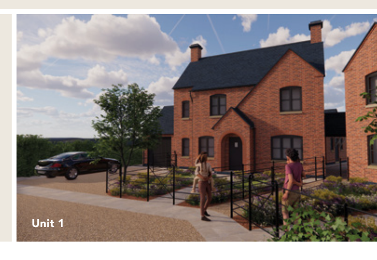
Unit 1 (Total 2350 sq ft inc garage)