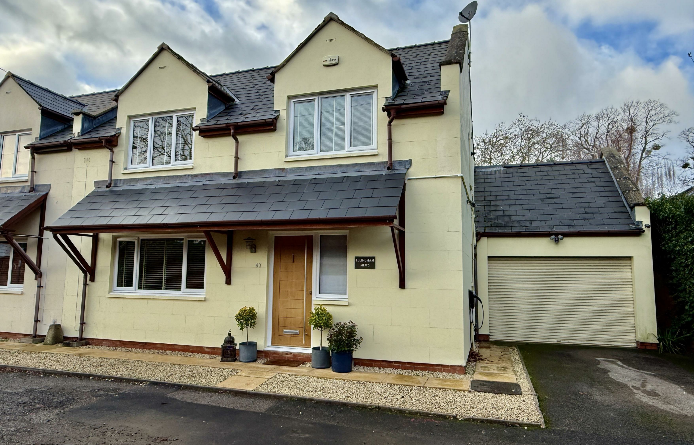
ELLINGHAM MEWS 83 MALDEN ROAD, PITTVILLE CHELTENHAM, GL52 2BT