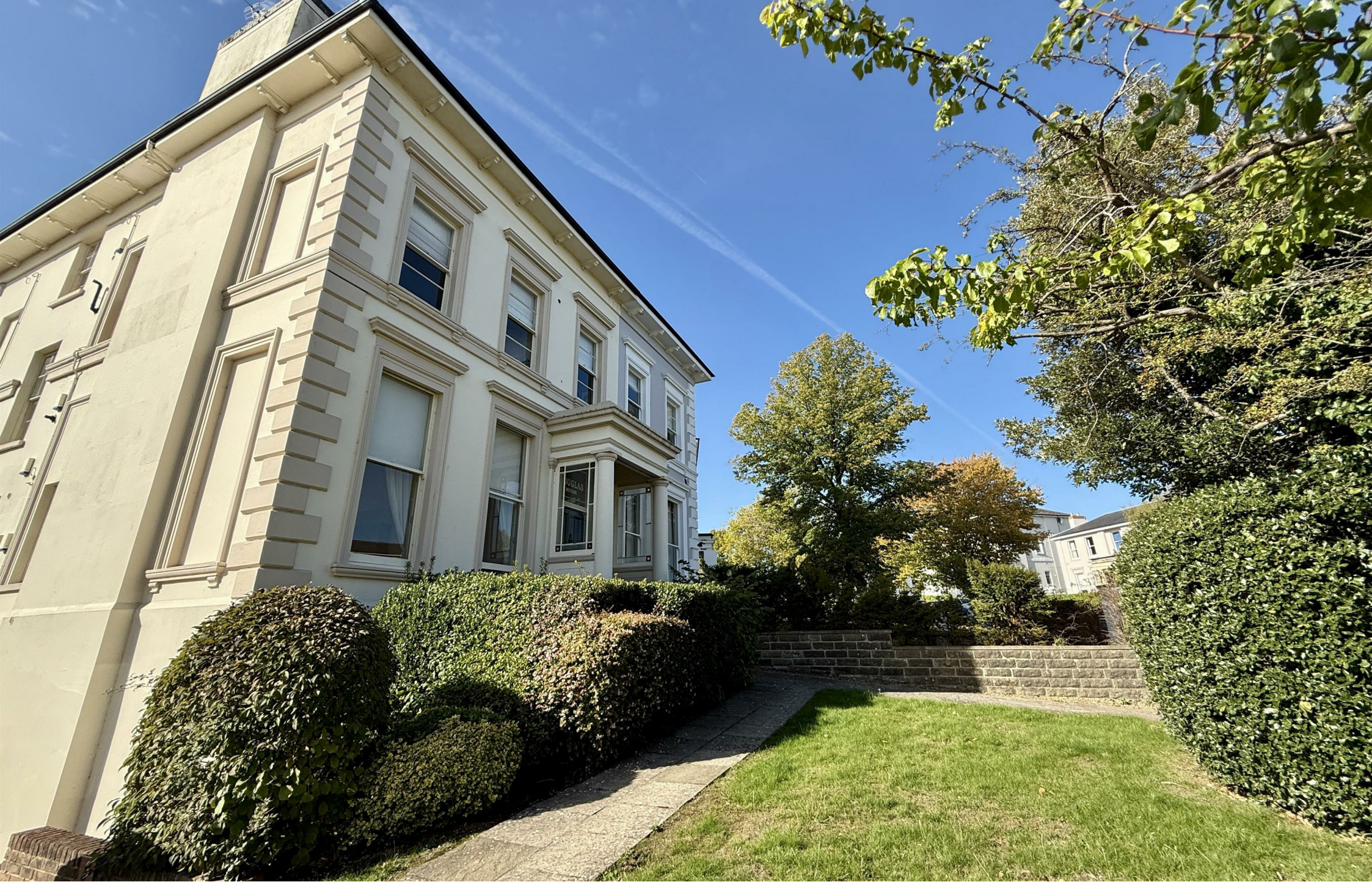
FLAT 1 DOUGLAS HOUSE PARABOLA ROAD, CHELTENHAM, GLOUCESTERSHIRE, GL50 3AH