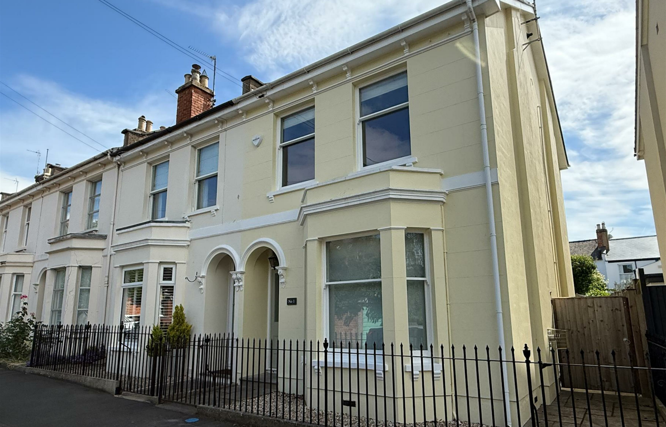
BREVINGTON 1 OAKFIELD STREET, CHELTENHAM, GL50 2UJ