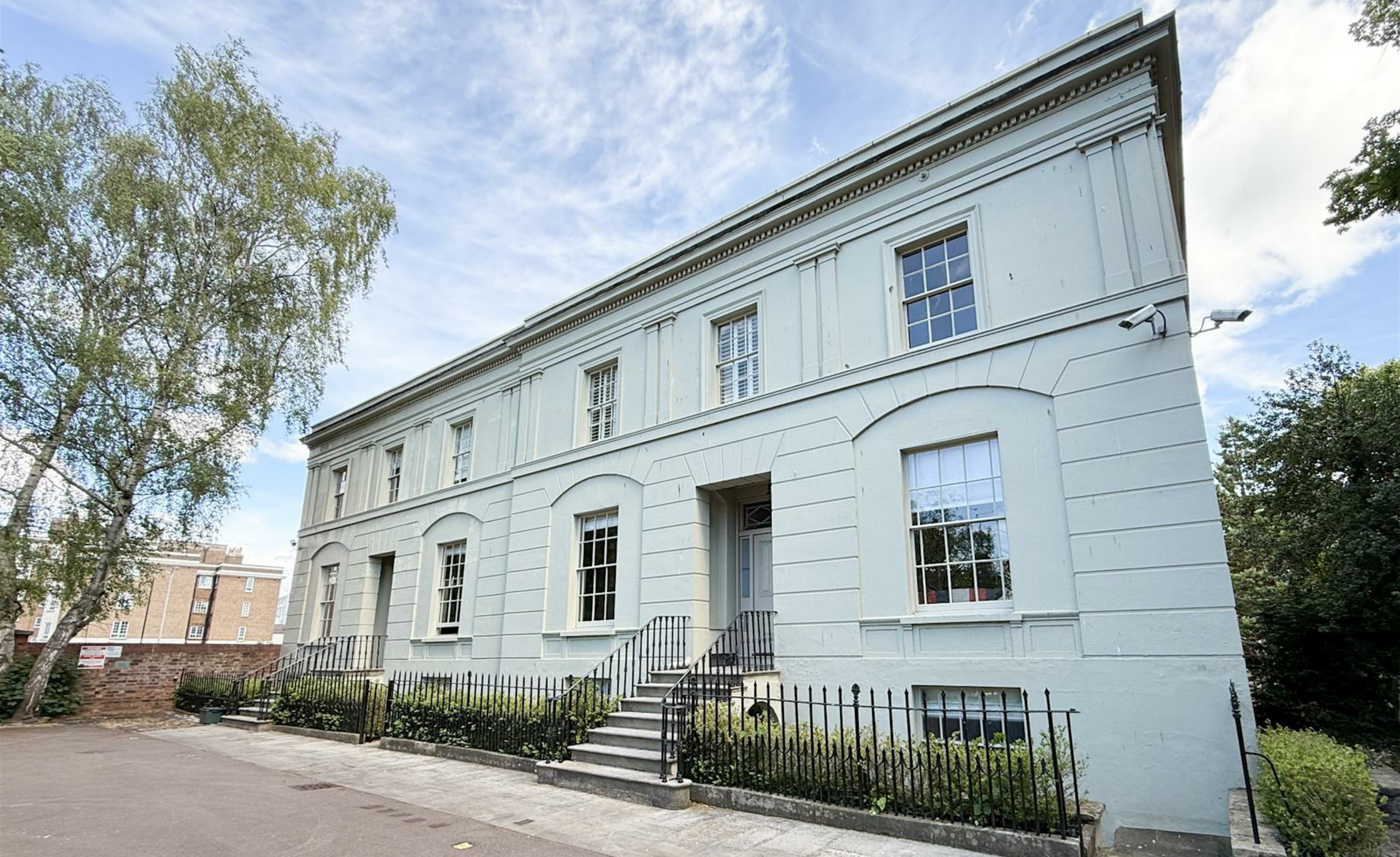
3 ORIEL VILLAS 2 ORIEL ROAD, CHELTENHAM, GLOUCESTERSHIRE, GL50 1XN