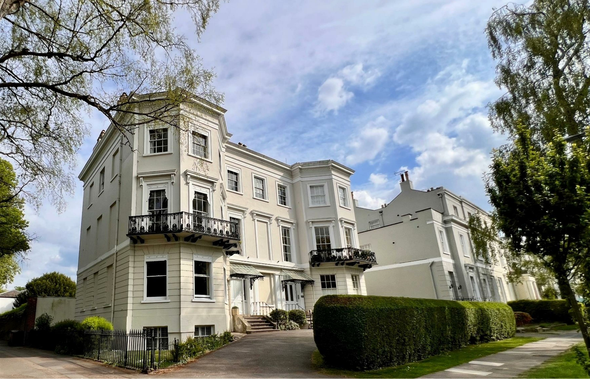
8 BERKELEY HOUSE 25 PITTVILLE LAWN, CHELTENHAM, GL52 2BE