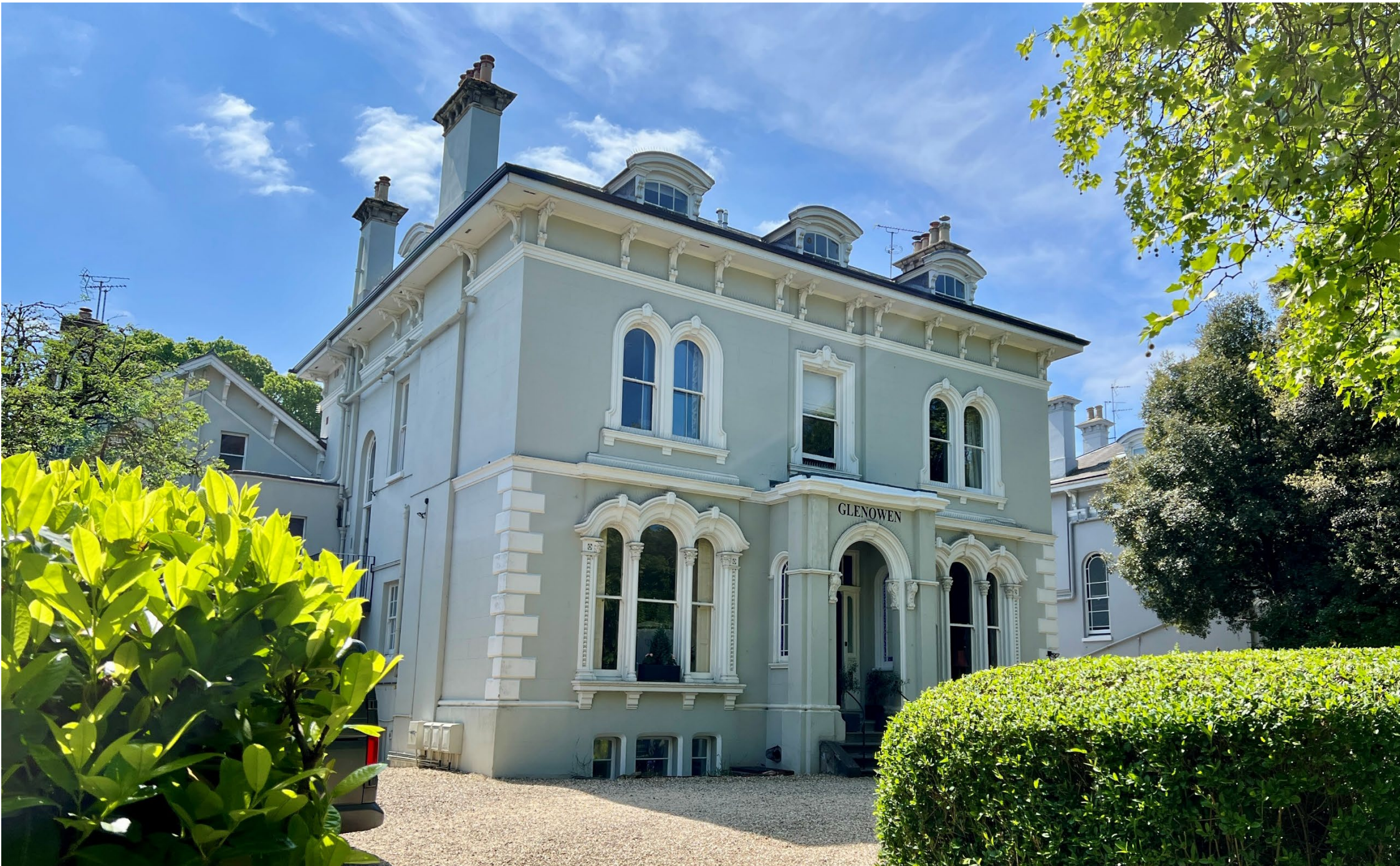
Flat 7 Glenowen House, 19 Lansdown Road, Cheltenham GL50 2JA