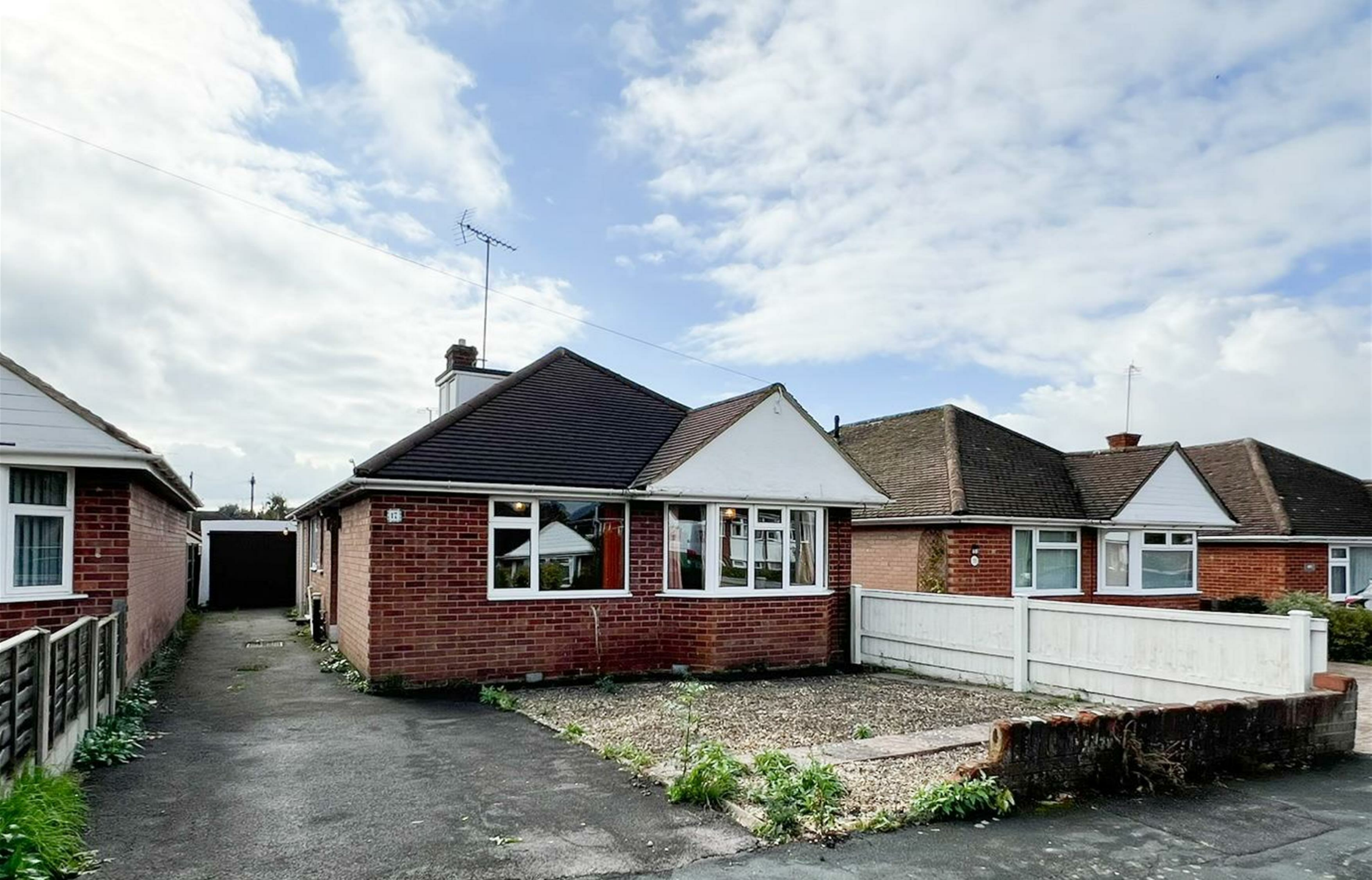
17 Norwich Drive, Cheltenham, GL51 3HD