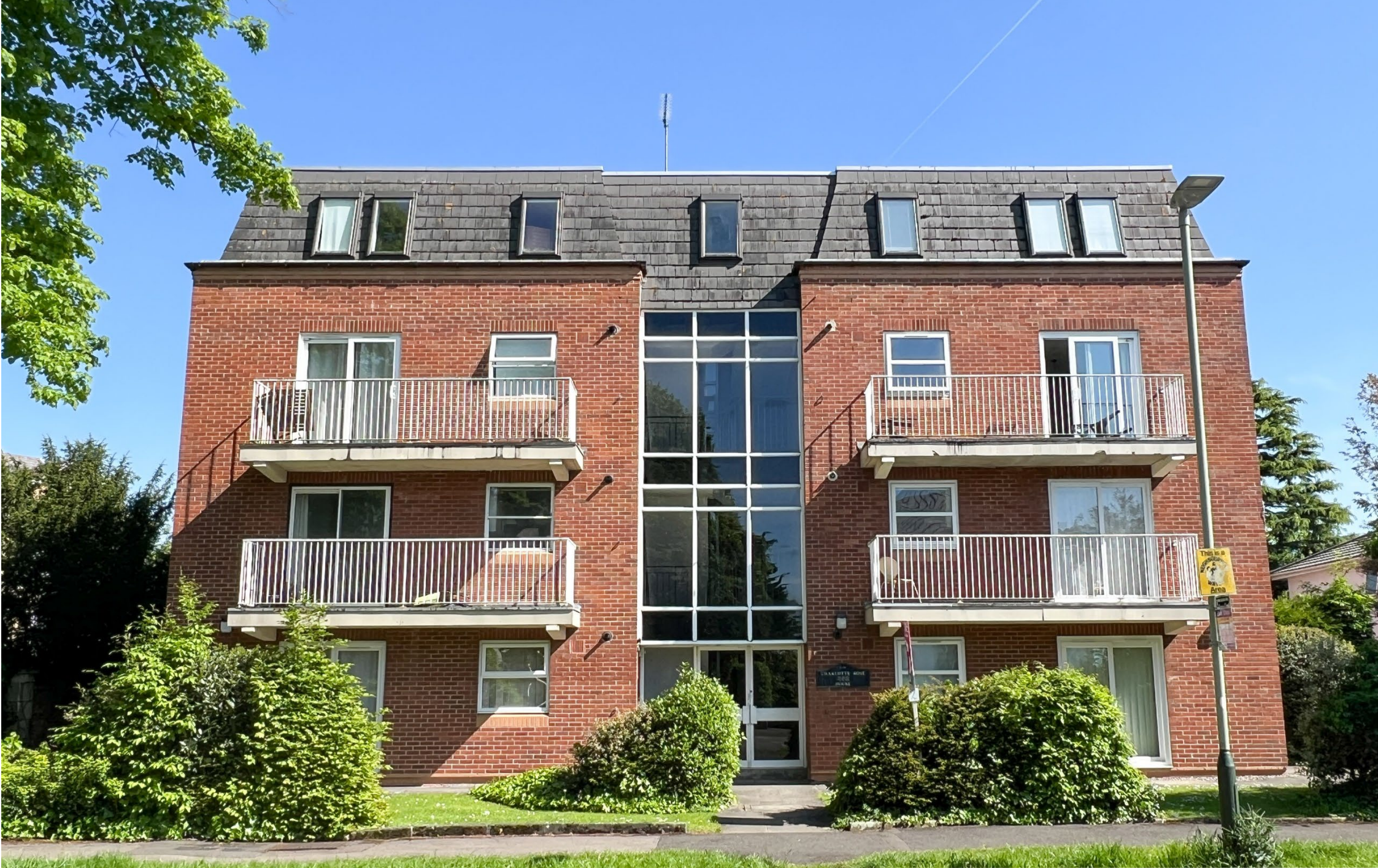
8 Charlotte Rose House, Christchurch Road, Cheltenham GL50 2PB