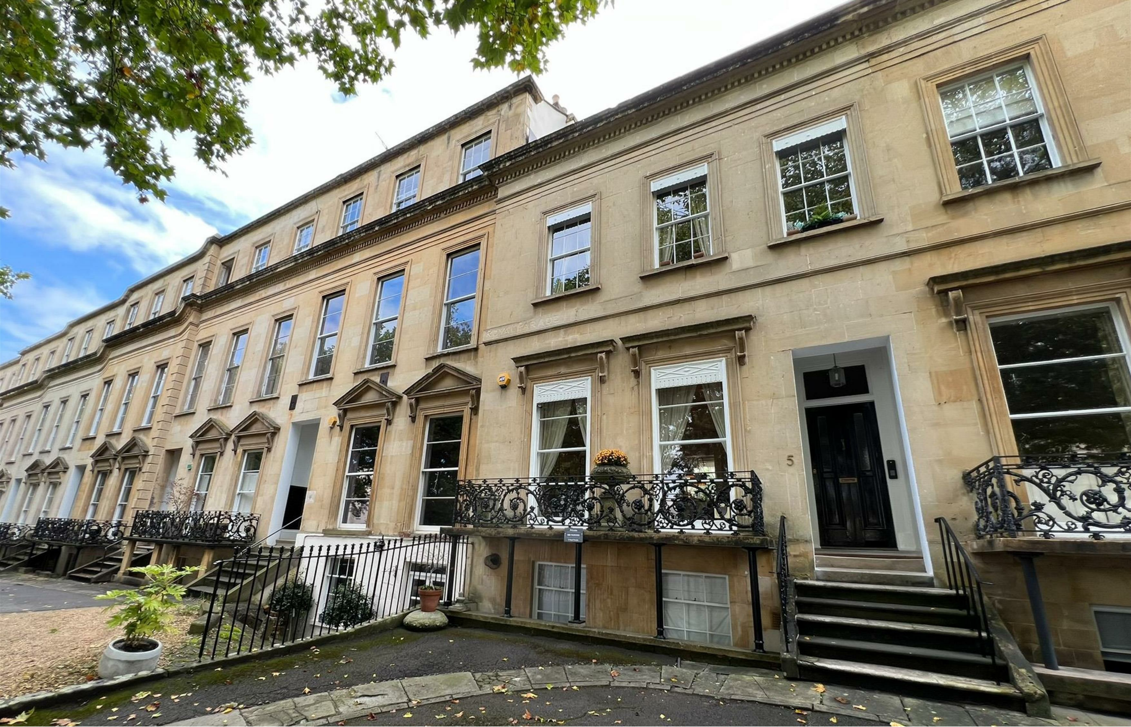
Apartment 3, 5 Royal Parade, Cheltenham, GL50 3AY