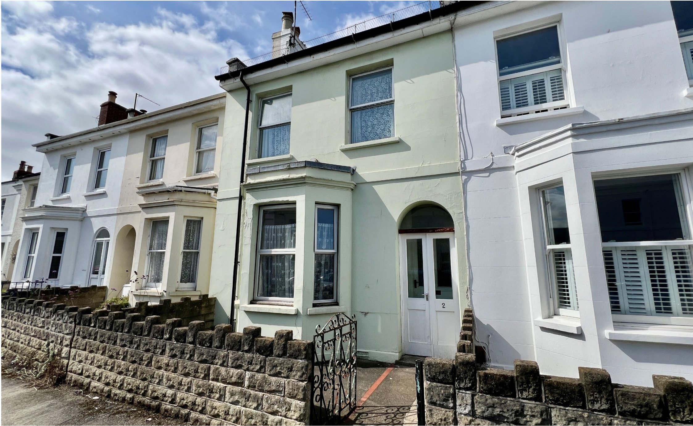
2 Llandudno Villas, Lypiatt Street, Tivoli, Cheltenham, Gloucestershire GL50 2TZ